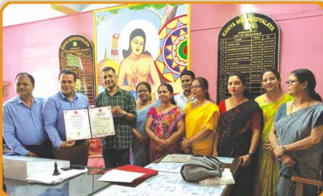
Moment of Displaying Certificate from NAAC