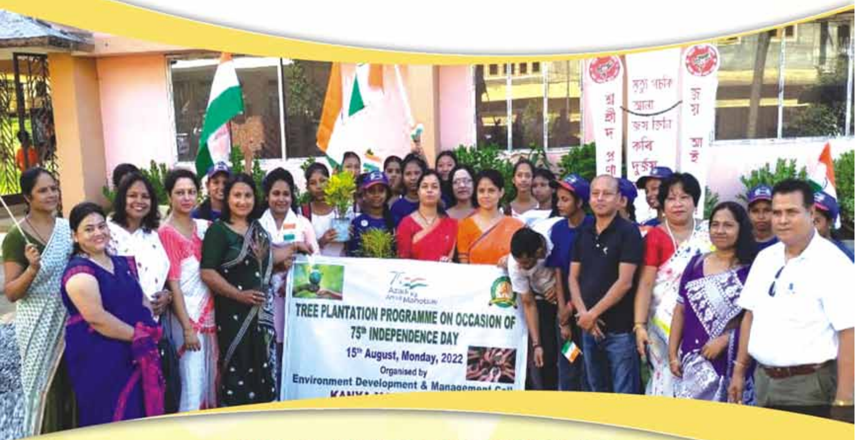
TREE PLANTATION PROGRAMME ON THE OCCASION OF "INDEPENDENCE DAY"

Admission of a candidate will be cancelled if any false information/misrepresentation in the online Form is detected subsequently, or if a candidate fails to produce the entire required document, in original, for physical verification.