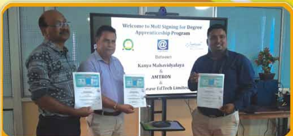
MoU with AMTRON