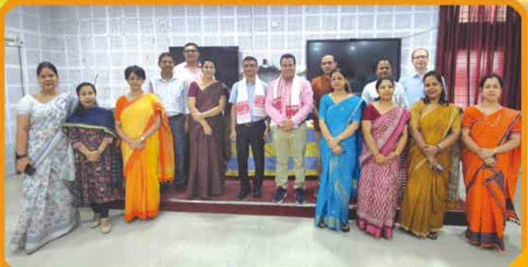
MoU with S.B. Deorah College