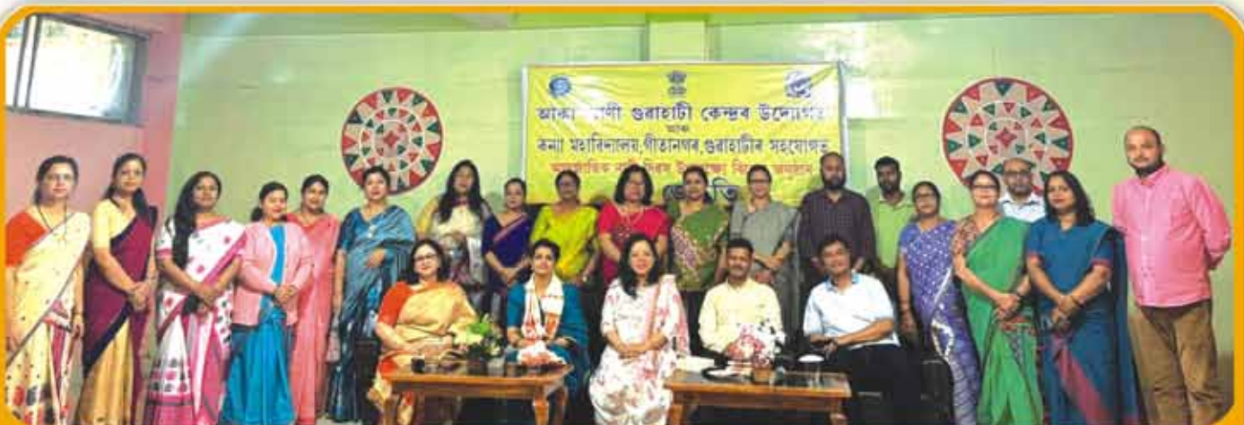
“Ghar Jeuti” - by All India Radio (Guwahati) on Women's Day