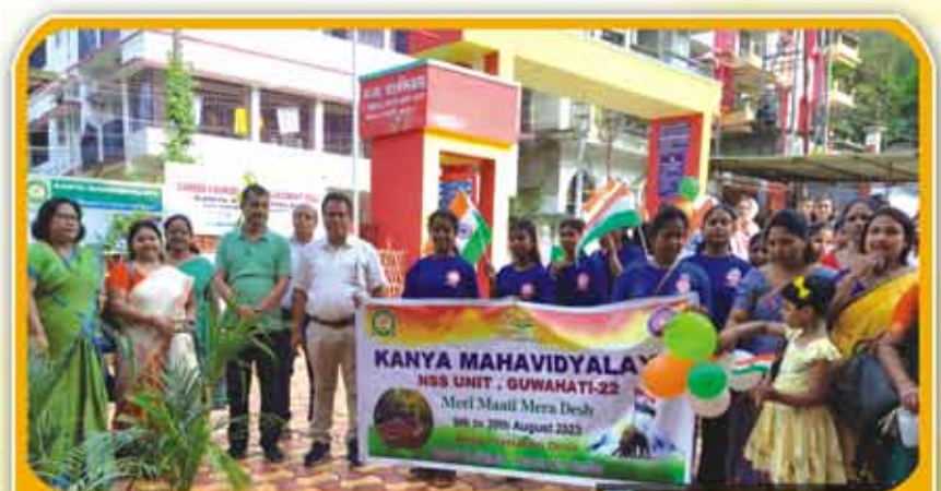
Meri Maati Mera Desh