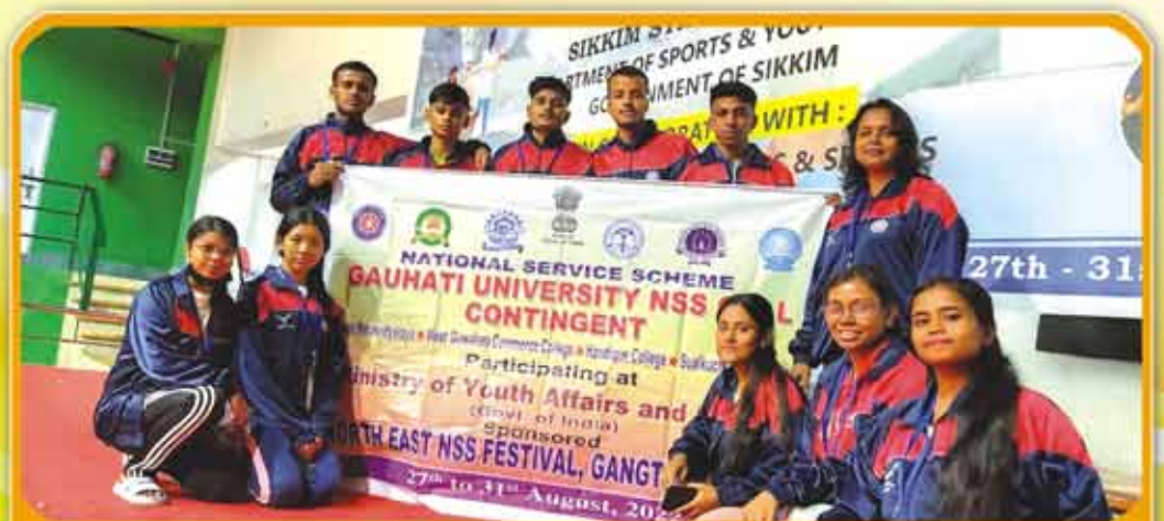
Participation in North East NSS Festival