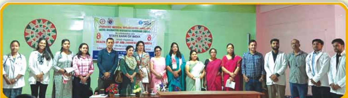
HEALTH CHECK-UP & AWARENESS PROGRAMME

The college library is established in 1977 along with the establishment of the college. In October 2022, the newly constructed library is named as Dr. Nagendranath Bujarbaruah Memorial Library. The library has a huge collection of books, newspapers journals, periodicals etc. The automation process is going on under SOUL-2.0 software. The library provides the various facilities such as separate reading room, open access, internet facility, previous question papers, e-resources (N-LIST), QR Code facilities, newspapers clipping etc. NDLI (National Digital Library of India) is also accessed by the college where the students can get educational materials from Primary to Post-graduate level. All types of resources like books, audio clips, lectures, video lectures, presentations, notes, simulations, question papers etc. are available here.